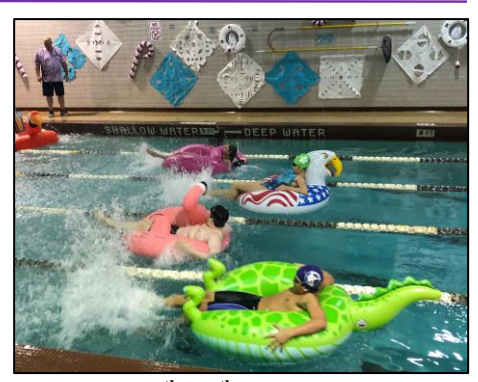
Above: The 6^{th} - 8^{th} graders competed against each other in a host of hilarious relays in the yearly Reindeer Games on December 19, 2018.

Congratulations to all our swimmers on a great season!